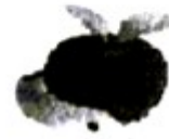
Eden Conservation Trust

Science Diet's "Second Chance for Love" shelter program has partnered with us and is donating pet food for all dogs, cats, kittens, and puppies being cared for here.