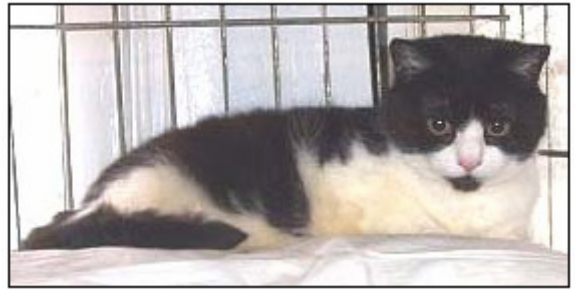
LILA - declawed

Lila came to us impersonating a bag of bones. Her skin was literally hanging off of her and she was starving to death. She is SO much healthier now but because of her horrible treatment by humans is still timid. However, she WANTS to be loved and enjoys petting. She is somewhat aggressive with other cats and would thrive in a quiet, adult home where she will have all the food she can eat.