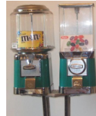
CANDY DISPENSING PROGRAM