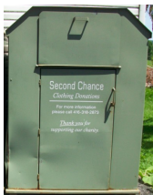
USED CLOTHING DROP BOX

We also gratefully accept Canadian Tire Money!